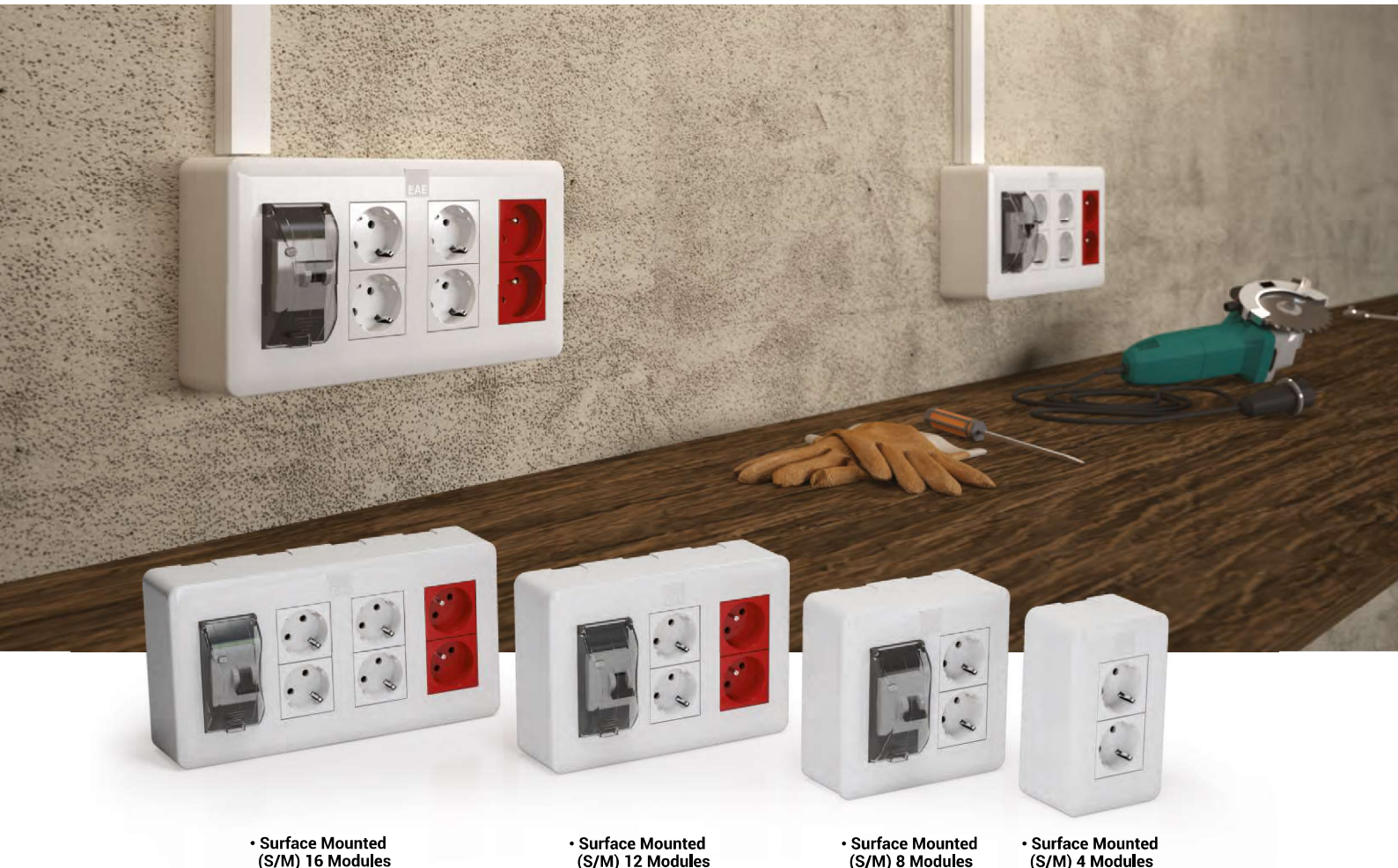
• Surface Mounted (S/M) 16 Modules